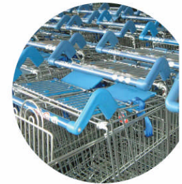
Clone Town Britain